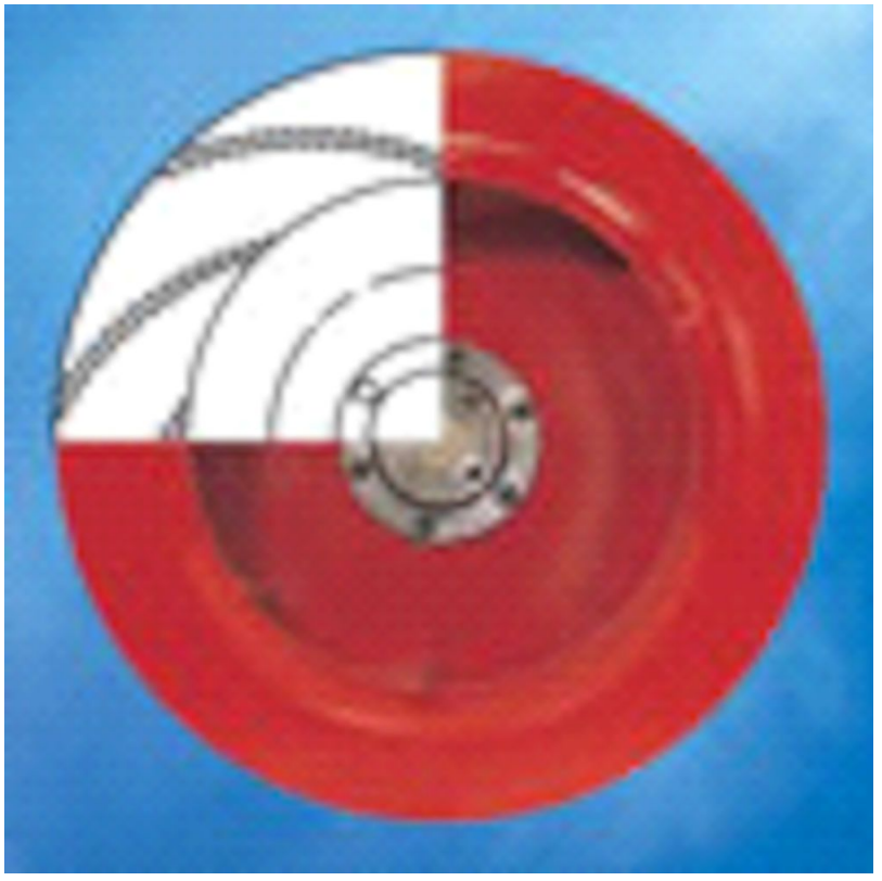
Clean Air Impeller - Type R

The clean air impeller is a closed bladed impeller with backward curved blades. This impeller is used for transport of clean air and of air with a small quantity of fine dust, such as welding smoke, oil mists or exhaust gases.