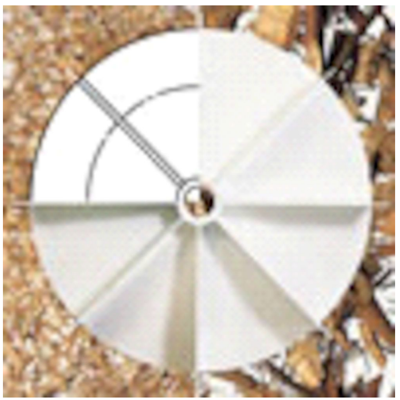
Transport Impeller - Type T The transport impeller is an open, self-cleaning bladed impeller with straight, radial blades. This impeller is used for transport of shavings, chips, etc. The transport impeller has an efficiency of up to 61%.